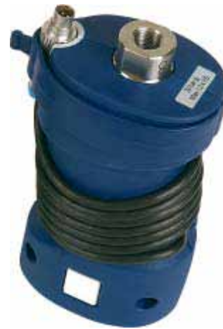
External IDOS universal pressure module

*Provides absolute pressure option in addition to gauge pressure. In absolute mode adds barometric pressure to gauge pressure range. For absolute mode ranges below 1 bar please consult your sales representative.