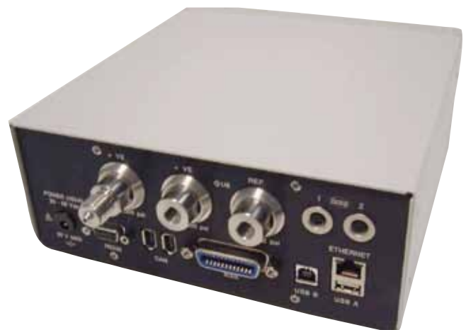
PACE1000 from the rear